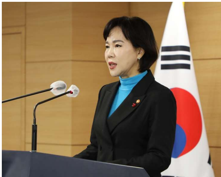
ACRC Chairperson disclosing the results of the 2021 AIA

The Anti-Corruption and Civil Rights Commission(ACRC) announced the results of the “Anti-Corruption Initiative Assessment(AIA)” conducted for 273 public institutions, including central government agencies, local autonomous governments, offices of education, and public service-related organizations.