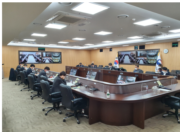
ACRC holding meetings for auditors of public institutions

The Anti-Corruption and Civil Rights Commission (ACRC) held “The meetings to deliver anti-corruption and integrity policies and tasks” for auditors of public institutions to continuously increase the Corruption Perception Index (CPI) and to complete the anti-corruption and fairness reform based on environmental changes such as COVID-19 and the Fourth Industrial Revolution.