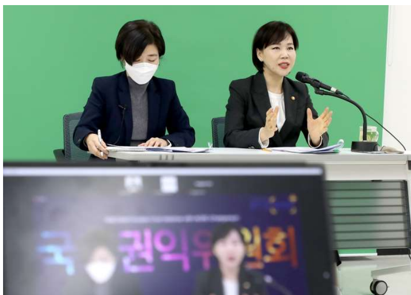
ACRC Chairperson explaining the Korean gov't anti-corruption policy etc.

On January 14, the Anti-Corruption and Civil Rights Commission (ACRC, Chairperson Jeon Hyun-Heui) explained the Korean government's anti-corruption policy achievements and the ACRC's efforts to strengthen legal and institutional foundation for effective prevention of corruption at a webinar jointly held with the American Chamber of Commerce in Korea (AMCHAM).