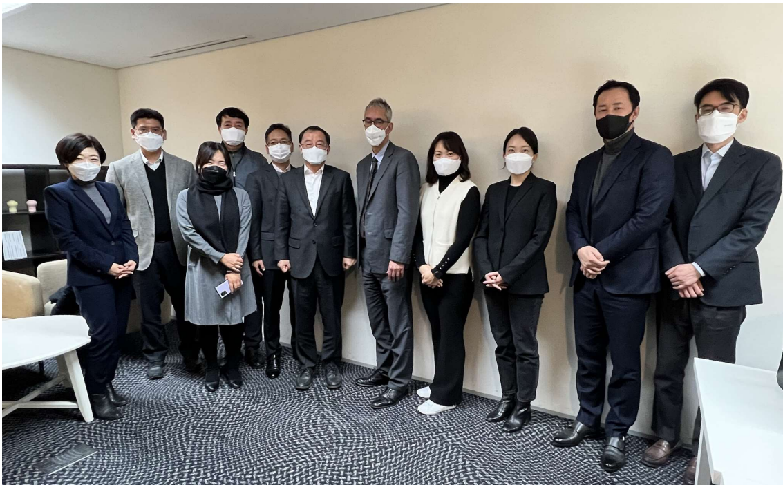
Foreign Business Grievance Meeting between the ACRC and the ECCK

On January 13 at 10 AM, the Anti-Corruption and Civil Rights Commission (ACRC, Chairperson Jeon Hyun-Heui) had an onsite foreign business grievance meeting with the European Chamber of Commerce in Korea (ECCK) to hear difficulties of international companies operating in Korea and discuss about institutional improvement issues.