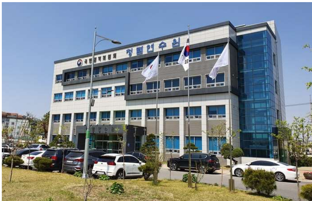
The Anti-Corruption Training Institute (ACTI) under the ACRC

Taking the opportunity of the major elections this year, the Anti-Corruption and Civil Rights Commission (ACRC) is planning to strengthen integrity education for high-ranking officials such as elected officials and public officials in political service and to create an “Integrity & Ethics Management Training Course” for public corporations and quasi-government organizations.